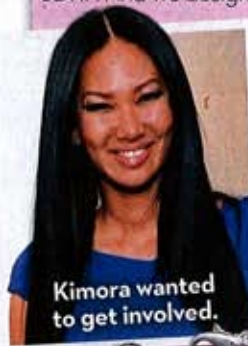
Kimora wanted to get involved.

bracelet to raise awareness and help kids in need. Medical ID bracelets save lives and we're proud ours is fabulously fashionable, too!"