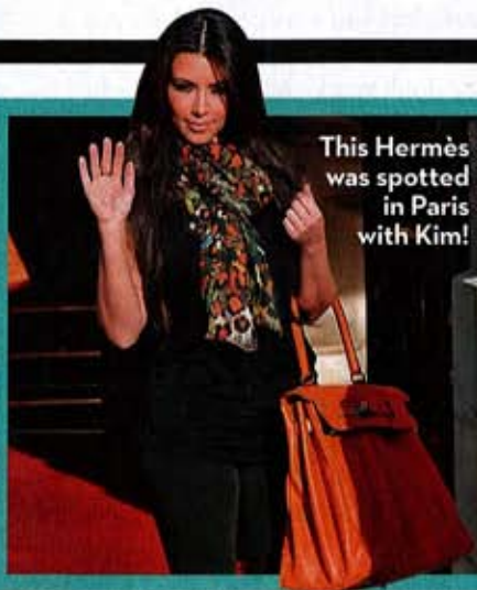
This Hermès was spotted in Paris with Kim!

Oh, no, has hell frozen over? Or isn't there enough space for all of Kim Kardashian's Hermès bags now that she's moving to Paris! We'd shove 'em under the bed, but Kim's auctioning off two of her prized bags at Heritage's Spring Handbags & Luxury Accessories Signature Auction in NYC April 28. Bidding for Kim's 50 cm Orange Kelly Bag starts at $7,500.